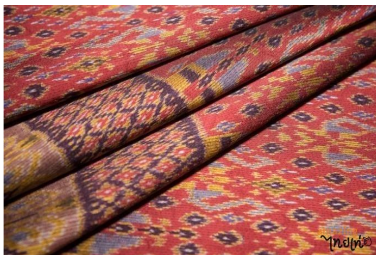
Examples of local mudmee from Baan Hua Fai Village.

Over the years, Baan Hua Fai has grown to be a village cooperative of almost 200 members, most of them women. Today, it has become a model OTOP enterprise that welcomes visitors and serves as a learning and collaborative center for design and production techniques. Younger generations are adopting new business models according to changing tastes and the marketing environment. They sell products online via Facebook and Instagram, and collaborate with Thailand’s top designers.